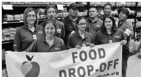
Large Business Winner - Cash N Carry