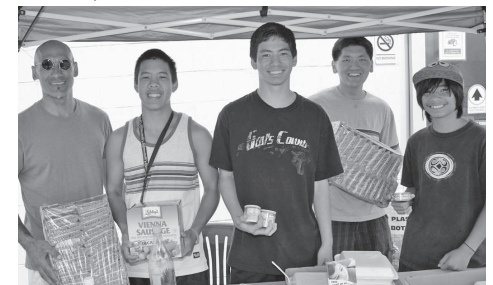
Cash N Carry