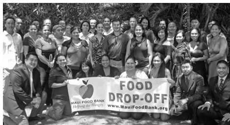
Small Business Winner - American Income Life of Kihei

The annual Battle of the Businesses competition proved to be quite a success this year! We had 35 businesses participate and raised over 13,000 lbs. of food! The competition was divided into Large and Small Business categories. The winner for the Small Business category was American Income Life of Kihei who raised 2,029 lbs. of food. For the Large Business category, VIP/Cash N Carry of Kahului took the prize, raising 2,090 lbs. of food. A special Mahalo to 99.9 KISS FM and to all of the business who participated in this successful campaign.