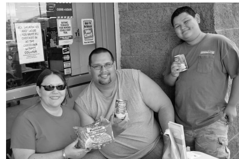
Sack N Save

Because of your generosity and with the help of our partner agencies, we are able to put food on the tables of people who are in desperate need of food relief. It is a team effort and we sincerely appreciate all of our food and financial donors who have joined together with us to make a difference.